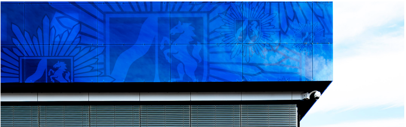
MULTIPACT® at the Police Headquarters, Mönchengladbach, Germany.